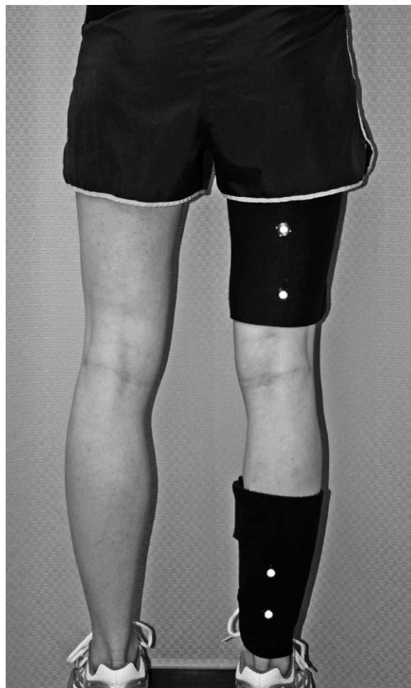
Figure 1. Retroreflective marker placement used for kinematic data collection.

All PFPS patients were given a 3-week hip-abductor muscle-strengthening protocol consisting of 2 exercises (Figure 2). These exercises were to be performed using a 5-ft (1.52-m) piece of Resist-A-Band (Donovan Industries, Inc, Tampa, FL) for 3 sets of 10 repetitions of each exercise, for each leg, daily over the course of the 3 weeks. The patients were instructed to move the involved limb outward for 2 seconds and inward for 2 seconds and to exercise both limbs using this common therapeutic protocol because the contralateral limb also benefits from the exercise. 25 All PFPS patients returned after 7 to 10 days for a follow-up to log exercise program adherence and to have their exercise technique checked. If the sets and repetitions were being performed too easily, a piece of band offering greater resistance was provided. The PFPS participants were asked to refrain from any therapeutic treatments other than the 2 exercises, and all volunteers were encouraged to continue with their regular running schedule at their discretion. It is important to note that all